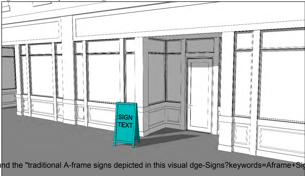
Figure 24-39: Example A-Frame Sign

We have found the "traditional A-frame signs depicted in this visual dge-Signs?keywords=Aframe+Sign